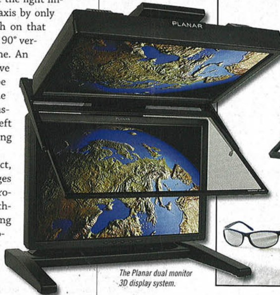
The Planar dual monitor 3D display system.

with the initial approach focusing on polarized light. A big issue with entertainment applications is content—which creates a chicken and egg scenario. It's hard to justify purchasing a 3D system if there is no content available, and it's equally hard to justify 3D content creation if there is no infrastructure in place to support that content. Fortunately, both aspects are converging today.