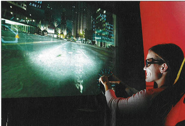
A 3D driving game facilitated by a ColorLink polarization projection display system.

Polarization technology makes 3D almost painless