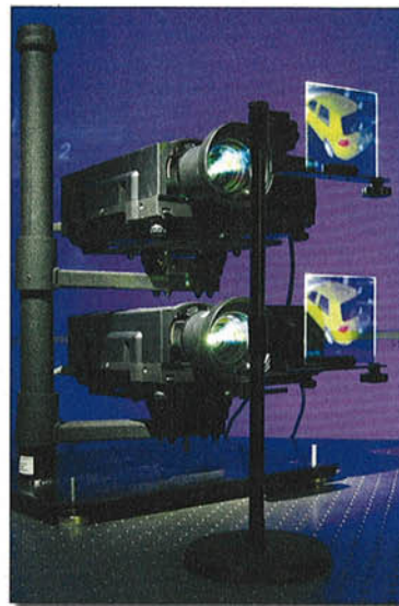
Dual projectors provide the appropriate polarization imagery for each eye with this approach from ColorLink.

As with ColorLink, Planar has an appreci-